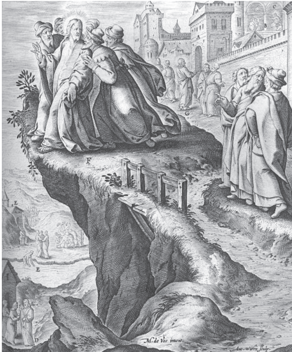
Attempt to Throw Christ Off a Cliff, by Jerome Nadal