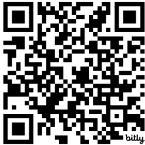
St. Michael's website

Online Giving: make your secure, private donation by scanning one of these QR codes.