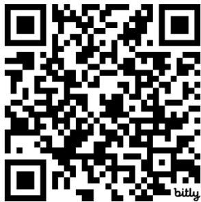
St. Michael's website